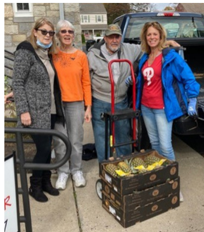
Produce delivery to a preschool

You can continue to help by supporting Advocates in your prayers for a successful revitalization for Advocates, for all the people to work together in cooperative dialogue, for uniting to achieve what is best for all those in need, for encouraging folks to become educated and informed about food insecurity, and for commitments of time and talent to improving the system. Keep the mountain moving!